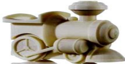
Thiết bị dạy học trực quan