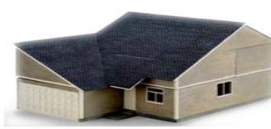
Mô hình kiến trúc