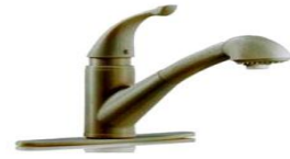
Sản phẩm gia dụng

* FDM: Fused Deposition Modeling 熔融擠製成型 (Công nghệ tạo hình bởi từng lớp nhựa nóng chảy)