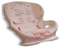
Chi tiết ô tô