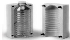
Tạo khuôn mẫu